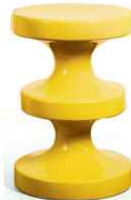
India Mahdavi's multipurpose Bishop stool is perfect for small spaces. From Comptoir102, Dhs6000

Collecting newspapers and toys in baskets makes it easier to find what you need. Viktigt basket from IKEA, Dhs49