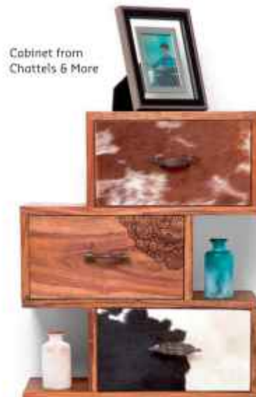
Cabinet from Chatta's & More

Start: Make three piles: one for keeping, one for giving away or selling and one for donating. Only keep things you know you will need or that have sentimental value. If you have not used something in the last year you probably will not use it again. Why not give it to someone who will appreciate it?