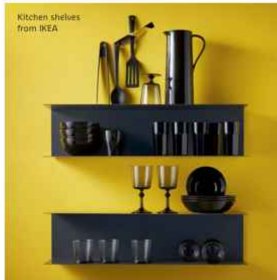
Kitchen shelves from IKEA

Amrit adds, "One of the best ways to use mirrors is to install a floor-to-ceiling mirror which creates the illusion of a bigger room but can also serve as a feature wall."