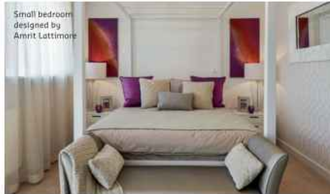
Small bedroom designed by Amrit Lattimore