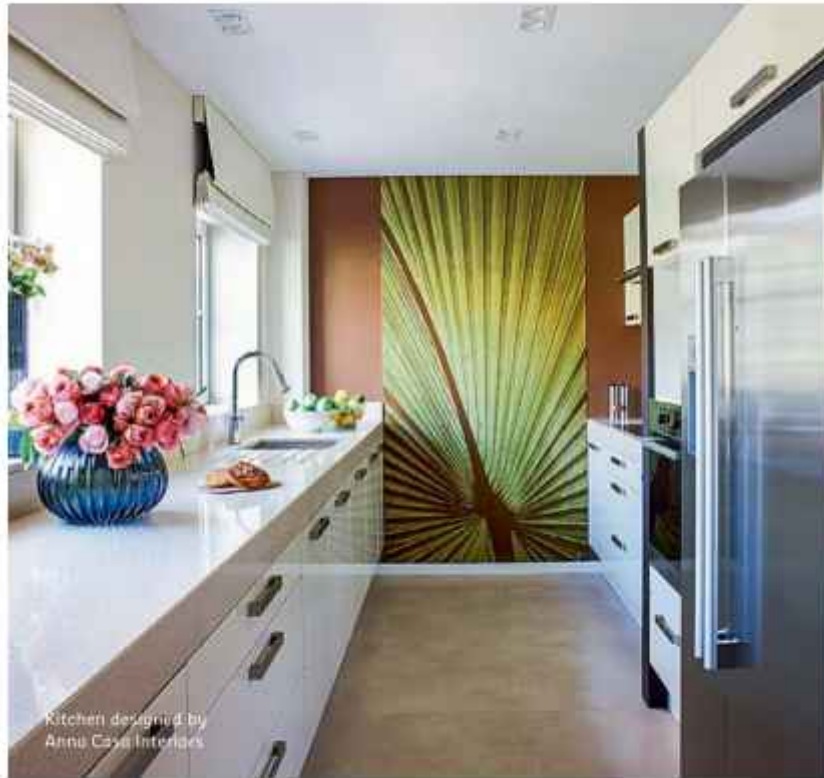
Kitchen designed by Anna Casa Interiors