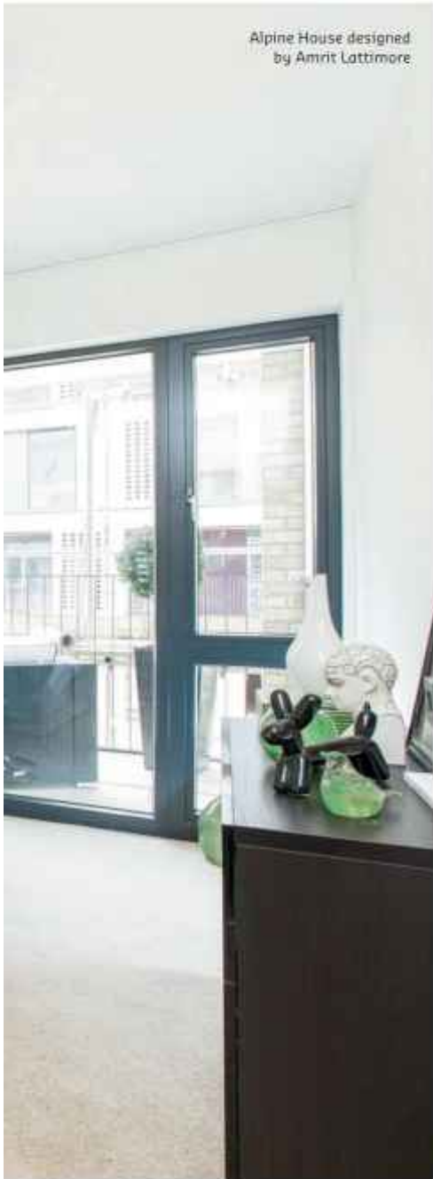
Alpine House designed by Amrit Lattimore