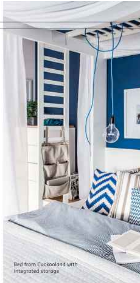
Bed from Cuckooland with integrated storage

Michelle says, "Do not be limited by the number of square meters. Consider using the space in cubic meters instead! Use the height of the room for storage. Corner sofas are a winner for petite living rooms as they accommodate multiple people without crowding the room. When choosing a corner sofa, lighter colours make a room look larger and increase design possibilities."