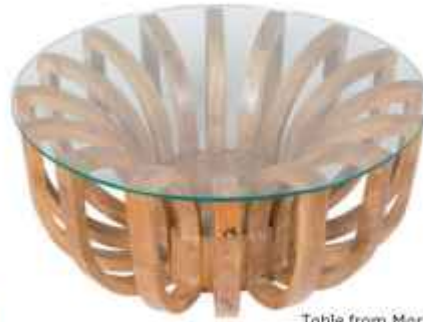
Table from Marina Home, Dhs2,250

"I would recommend layering neutral shades within a room and keeping dark colours to a minimum," says Anna. "For example, using lighter colours for the walls, carpets and and larger furniture pieces, whilst accessorising with accents of darker colours. Like colours, textures and materials used in your design should be kept light too. Heavy textures such as velvets and wools can sometimes be stifling so I like to keep smaller spaces cool and airy, with fabrics like cotton and linen for both upholstery and window treatments."